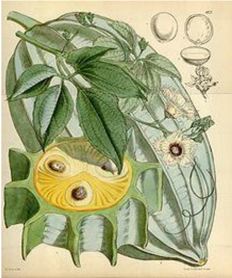
Plate 1. Telfairia occidentalis , illustrated by Joseph Dalton Hooker, 1877

with the light green colour of the fruit when young, and yellow when ripe [10]. Dioecious flowering is most common in the fluted gourd, with very few documented cases of monoecious flowering.