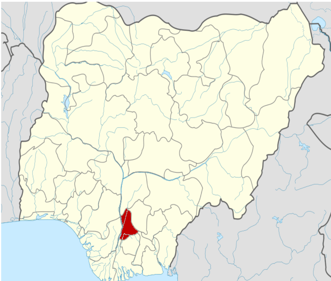
Plate 2. Uli Location in Nigeria map

Uli is a town of historic importance situated at the extreme southeast corner of Ihiala local government area of Anambra state in Nigeria. Its closest neighbouring towns are Amaofuo, Ihiala, Amorka, Ubulu, Ozara, Egbuoma and Ohakpu. Uli town extends westward to the confluence of the rivers of Atamiri and Enyinja, and across Usham Lake down to the lower Niger region. Anambra State University is located in Uli. The major markets in Uli is Nkwo Uli and Orié Ubahudara.